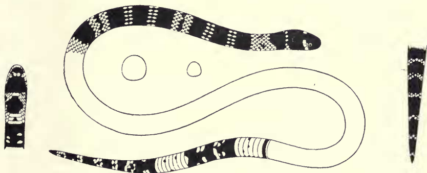
FIG. 34. Type of Micrurus elegans Jan (from Icon. Gen. Ophidiens, Livr. 42, pl. 5, fig. 2).

there is a series of white scales arranged like a necklace of pearls; behind this there is a large black triangular marking, followed by a light band (red), extending for three or four scale-lengths, in which the tips of the scales are black. From this point there are thirteen or fourteen groups of triple black bands [triads], which tend to be confluent beneath, each [individual] band extending over three or four scales and separated from each other by a single series of white scales [really by a double series, cf. plate]. The spaces between the triads are 4 scales long, and there are large black spots in these [red] bands on the ventral surface. The tail is black, with six white rings formed by a single series of scales.